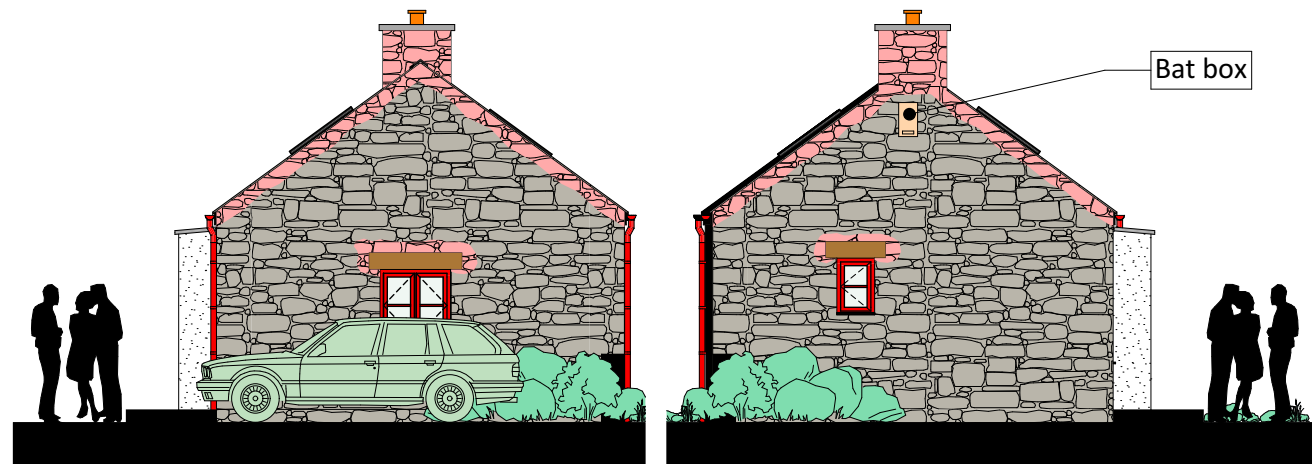
Side Elevation (north-east)