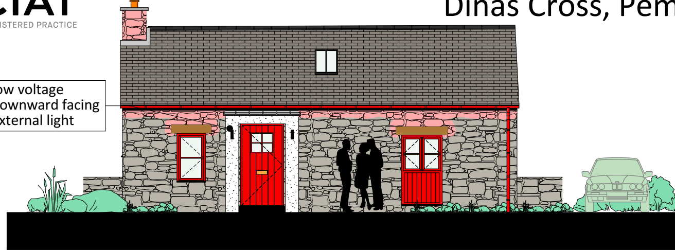
Front Elevation (north-east)

low voltage downward facing external light