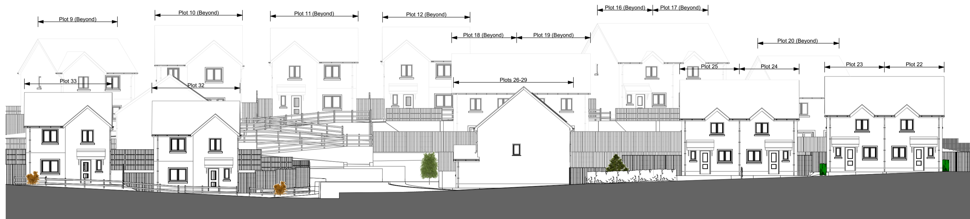
Street Section/Elevation F-F